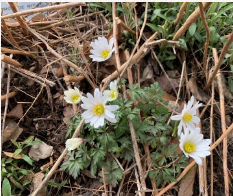
Anemone blanda 'White Splendour'

We have over 66,000 bulbs that start blooming in March, making for a vibrant show of daffodils, tulips, crocuses, and more. As plants and flowers “spring” back to growth, the garden is fresh and green with a light, emergent feel.