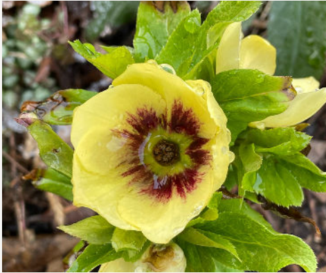
Helleborus x hybridus