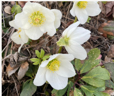
Helleborus 'HGC Yosef Lemper'