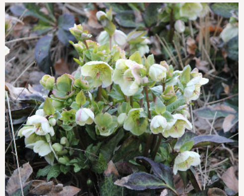
Helleborus 'Molly's White'