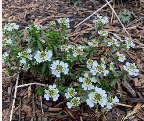
Iberis sempervirens 'Autumn Beauty'