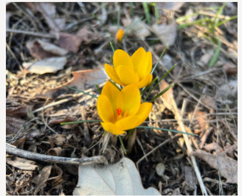
Crocus chrysanthus 'Goldilocks'