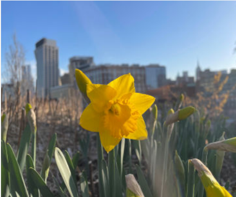
Narcissus 'Gigantic Star'