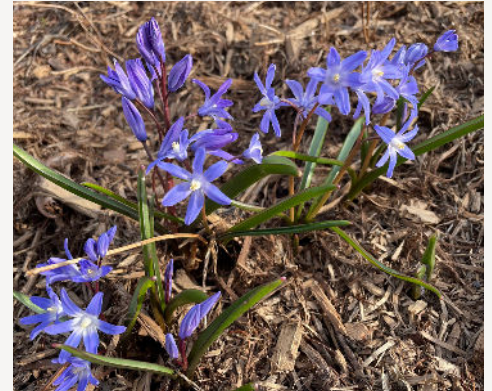
Scilla forbesii 'Blue Giant'