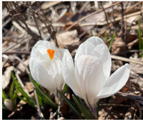
Crocus vernus 'Jeanne d'Arc'