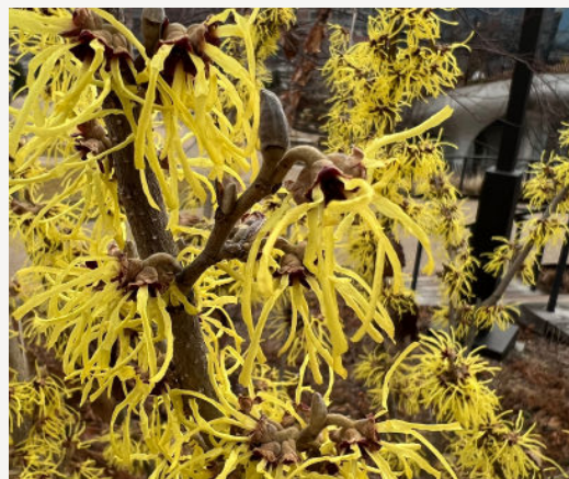
Hamamelis x Intermedia 'Swallow Hayes'