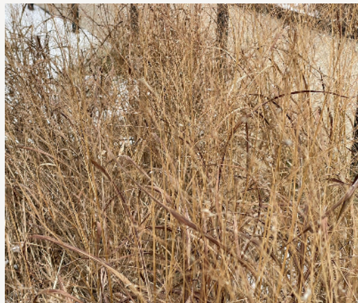
Panicum virgatum 'Shenandoah'