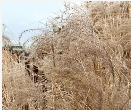
Miscanthus sinensis 'Morning Light'