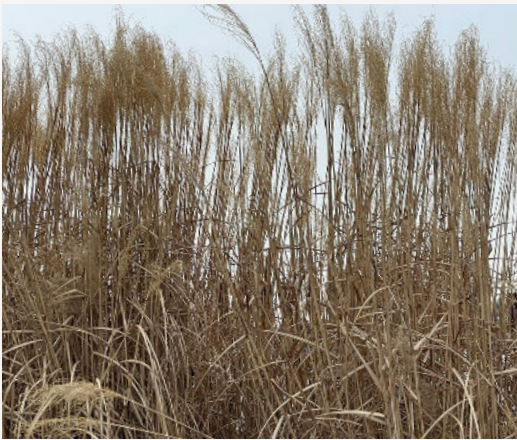
Miscanthus sinensis 'Gracillimus'

At Little Island during the winter season, the ornamental grasses create a spectacular display of movement to our gardens with feathery plumes swaying in the crisp winter air.