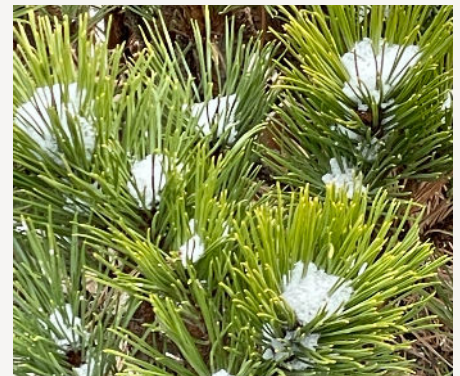
Pinus mugo var. pumilio