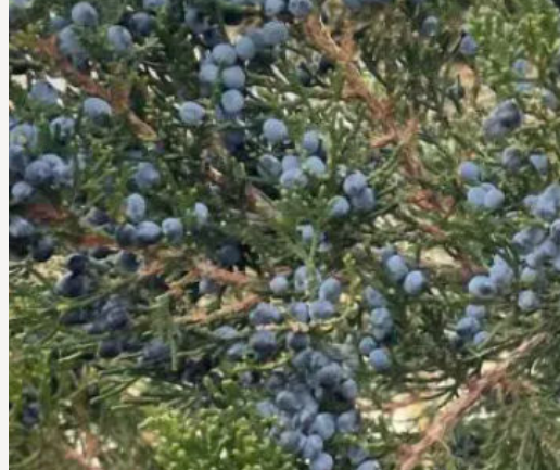
Juniperus virginiana 'Canaertii'