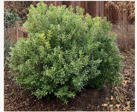
Ilex glabra 'Shamrock'