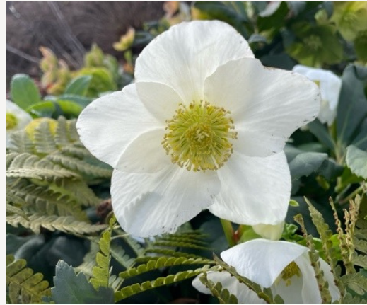
Helleborus niger 'HGC Josef Lemper'