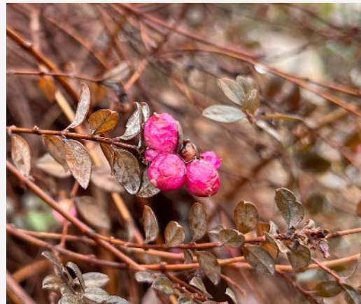
Symphoricarpos x chenaulti 'Hancock'