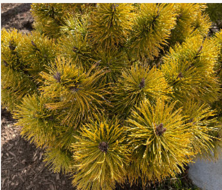
Pinus mugo 'Wintersonne'

Our evergreens were specifically chosen for the colorful hues they unveil during the winter and the ones in The Play Ground also serve a practical purpose to protect you from the cold winter wind and the noise from the highway.