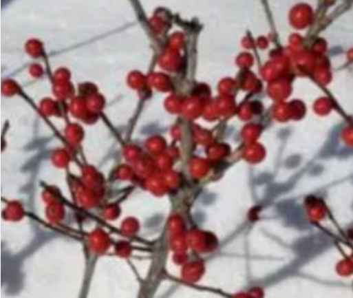
Ilex verticillata 'Red Sprite'

During this season, our landscape comes alive with a variety of berries, offering a nutrient-rich treat for various bird species on chilly days.