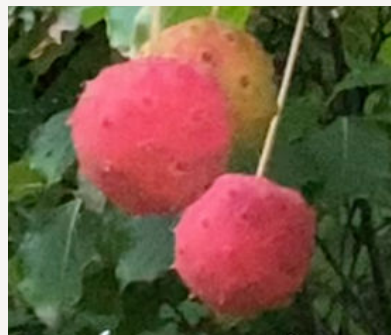
Coronula kousa var. chinensis 'Milky Way'