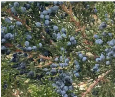
Juniperus virginiana 'Canaertii'