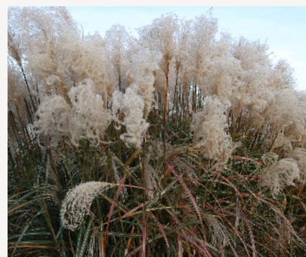
Miscanthus sinensis 'Morning Light'