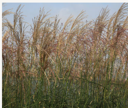
Miscanthus sinensis 'Gracillimus'