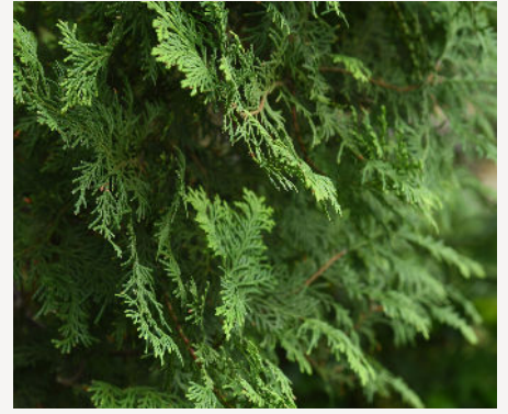
Thuja occidentalis 'Elegantissima'