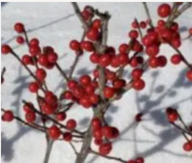
Ilex verticillata 'Red Sprite' (Winterberry)

During this season, our landscape comes alive with a variety of berries, offering a nutrient-rich treat for various bird species on chilly days.