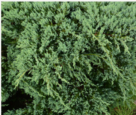
Juniperus procumbens 'Nana'