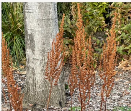
Astilbe chinensis 'Purple Candles'

At Little Island during the fall season, the ornamental grasses create a spectacular display of swaying feathery plumes sway in the crisp autumn air. Vibrant hues of gold, bronze and crimson not only add warmth but introduce, and movement to our gardens.