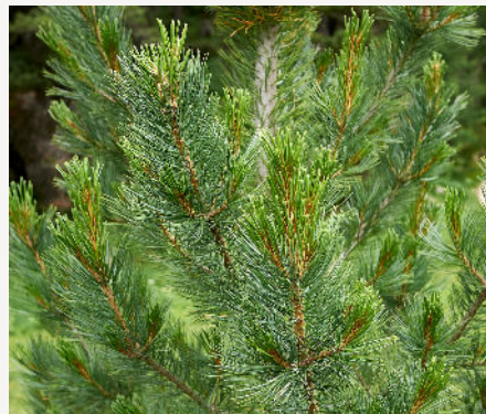
Pinus cembra 'Swiss Stone Pine'