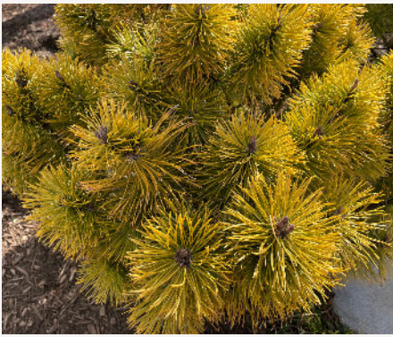
Pinus mugo 'Winter Sonne'

Our evergreens were specifically chosen for the colorful hues they unveil during the winter and the ones in The Play Ground also serve a practical purpose to protect you from the cold winter wind and the noise from the highway.